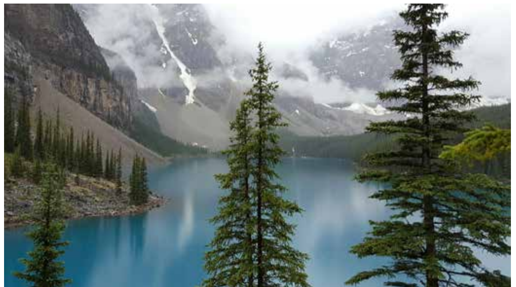
A spectacular view of Moraine lake