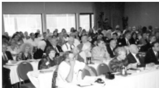
Ministers and wives meet at the Quails Inn Conference Center, San Marcos, CA.