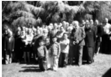
Lake Taupo, New Zealand

The management and staff of the hauswind wanted to know more about the Church, and asked for booklets and articles to read.