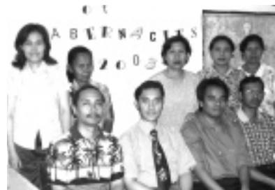
Indonesian brethren at the Feast