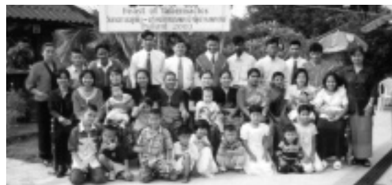
Mae Sot, Thailand

forward to returning next year, God willing.