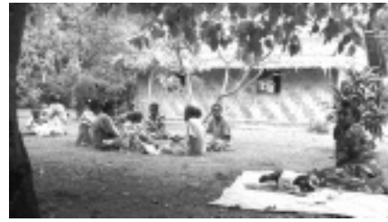
Port Vila, Vanuatu

way that made for a family-like atmosphere throughout the feast. Activities included an Asian dinner and games evening, in which each family brought its favorite Asian dish to share. After dinner, games and a Bible quiz were provided for children and adults alike. Other activities involved a mountain hike, a luncheon, and an afternoon at a small island inhabited by many free-roaming animals that could be fed and held.