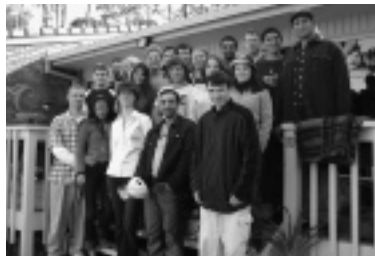
Bateman's Bay, NSW

during this Feast than ever before. At the end of the Feast, just before the farewell party hosted by the local Baguio brethren, a new family came to inquire about the Living Church of God.