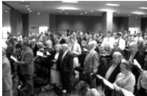
Myrtle Beach, NC

This was truly a great Feast, with brethren able to fellowship with other saints of like minds while enjoying a