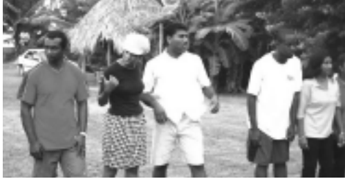
Trinidad and Tobago

On Thursday evening, there was a cultural show, catered dinner and dance, held at the Mayaro Civic