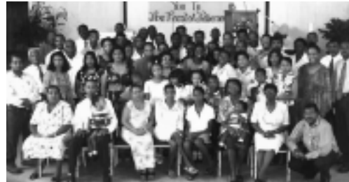
Trinidad and Tobago

The Feast of Tabernacles 2003 was held at the Mayaro Civic Center, in Mayaro, Trinidad. More than 70 brethren kept the Feast with Associate