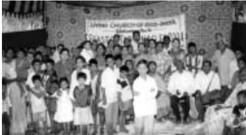
Bhimavaram, Andhra Pradesh

A total of 74 individuals attended the Feast site in Malaysia this year. Although the majority were