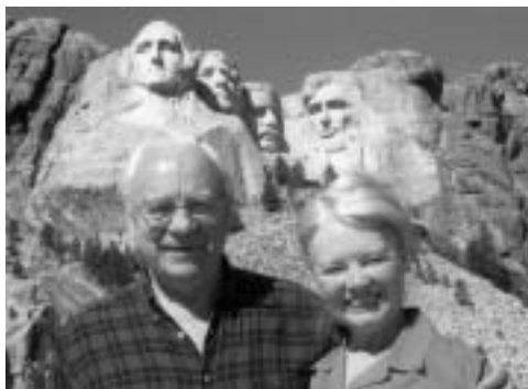
Rapid City, South Dakota

Sunny weather and beautiful fall colors welcomed 375 Feastgoers from around the United States and Canada