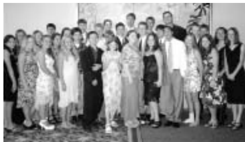
Panama City, Florida