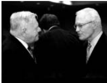
Myrtle Beach, South Carolina

Services were held in the Northwinds Meeting Room at Tan-Tar-A, Resorts. This beautiful resort property has a variety of housing and on-site activities. In addition to Tan-Tar-A, there are many other condominiums and hotels available in the community. Tourism is the prima-