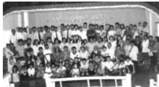
Davao City, Philippines

Festival progressed, brethren experienced beautiful weather, with sea breeze around the clock, well-fed by spiritual food and a nice physical diet. Sermons triggered thoughts about the events that will set the stage for the Millennium, about what constitutes the kingdom, about the good news of the royal family and about the Last Great Day, when most of humanity will be given its first genuine opportunity to learn and know about God's will.