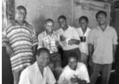
Wewak, Papua New Guinea

to give their sincere thanksgiving to God. Activities such as children's Bible classes, Bible bowl for all, the senior's night, the singles' event and other programs were meant to bring all Feastgoers closer and in harmony