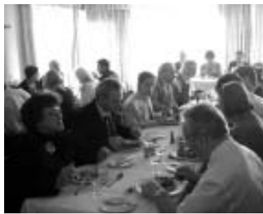
Llandudno, North Wales

Snowdonia. The region is dotted with prehistoric stone monuments, Roman ruins, medieval castles, peaceful river valleys and quaint country inns. Many commented that the highlights of the Festival were motivating, thought-provoking