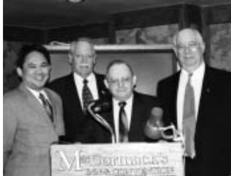
Prince Edward Island, Canada