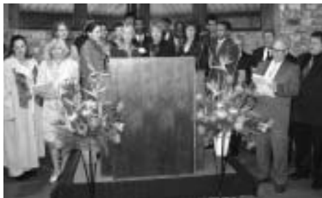
Glentana, South Africa