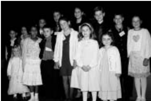
Batemans Bay, Australia

Throughout the Feast, a feeling of love, unity, friendship and giving was evident. Special functions were held for the children, the singles and the older brethren. The children enjoyed an afternoon of fun on the beach, the singles had a fellowship meal at a local restaurant and the older brethren came together for an afternoon of fellowship and food. A family night was held where the "Behind the Work" DVD was shown, followed by an evening of games. Many talented members performed at the Talent