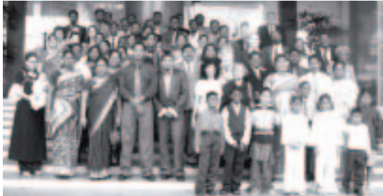
Port Dickson, Malaysia

While the central focus was on the spiritual aspects of the Feast, there was no let-up in the physical enjoyment in the form of nourishing meals and family-oriented activities. Apart from the barbeque dinner, there were also three other occasions when members got together for a combined luncheon. Also a host of activities were lined up. On one end of the family divide, little children enjoyed games and coloring books and the many gifts that were given out. The youth, on the other hand, had an afternoon out in the hotel’s