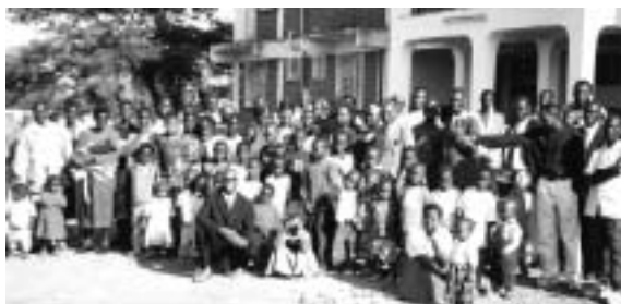
Homa Bay, Kenya

The Feast at Homa Bay, Kenya , in Nyanza Province, was a wonderful experience for the brethren, who all felt this was their best Feast ever in terms of brotherly love, and having "oneness" of spirit together. Ninety-one brethren, including one overseas member and one brother from neighboring Tanzania, completely