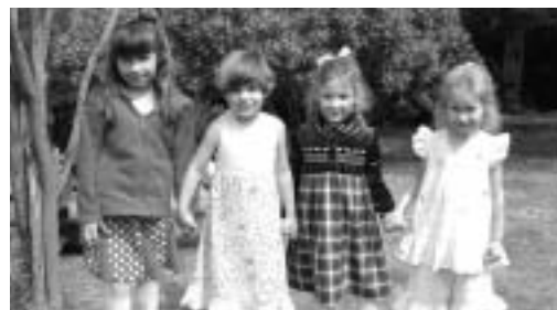
Glentana, South Africa

Brethren enjoyed the spring weather in a millennial setting in the southwestern coastal town of Glentana, South Africa . If Feast success can be measured by smiles, the score in