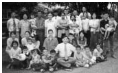
Mae Sot, Thailand