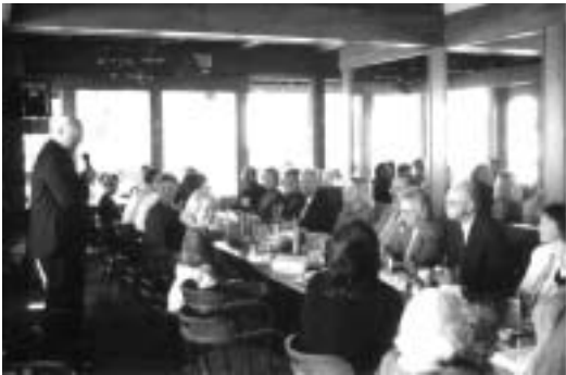
Squaw Valley, California

Many group activities were available for brethren in Squaw Valley. On Friday afternoon, 79 teens, singles and