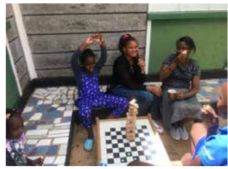
"And they continued steadfastly in the apostles' doctrine and fellowship, in the breaking of bread, and in prayers." — Acts 2:42